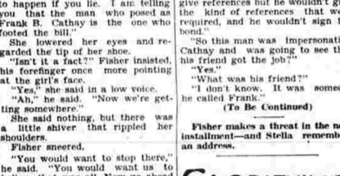
Pattern - 361